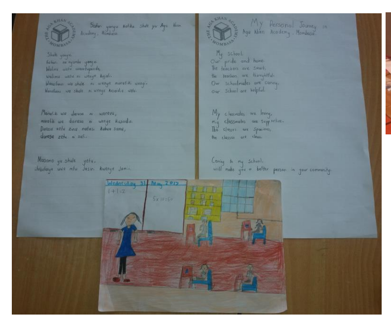
Poetry and Story Writing Workshop