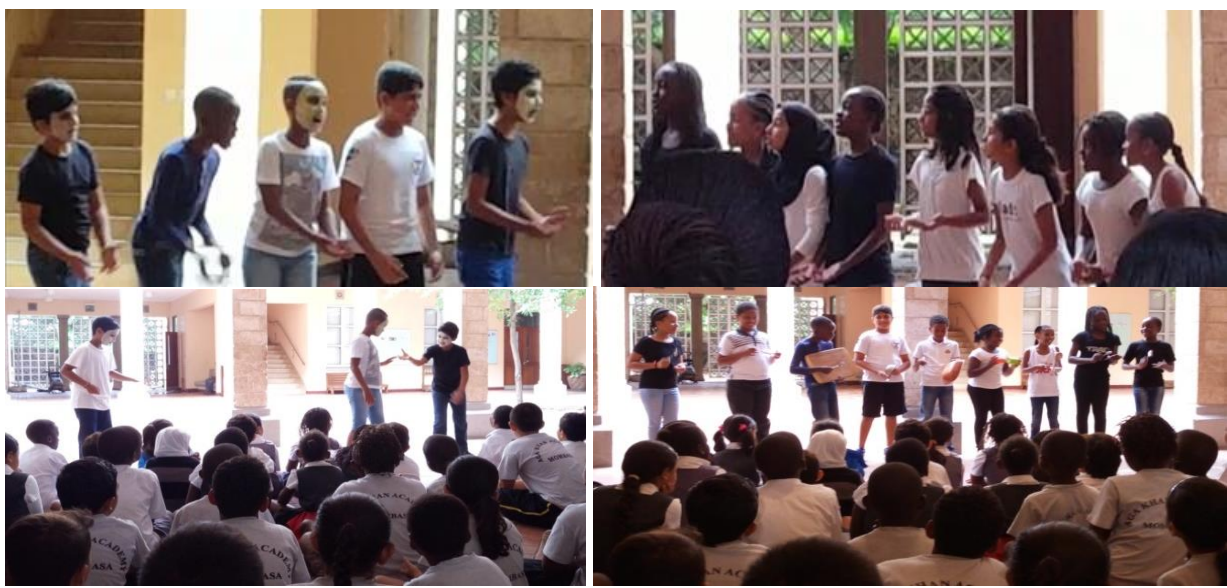
Year 4A Assembly

Students in Year 4 presented a three part performance for the assembly as provocations into their new unit on Drama. They expressed themselves through Luo tongue twisters, a mime Marikiti scene and a musical performance using kitchen tools. The students enjoyed brainstorming and collaborating with each other to bring an entertaining performance to the Junior School.