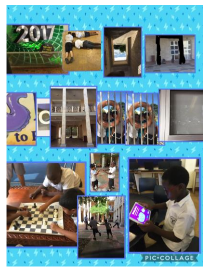
A collage from the photography workshop